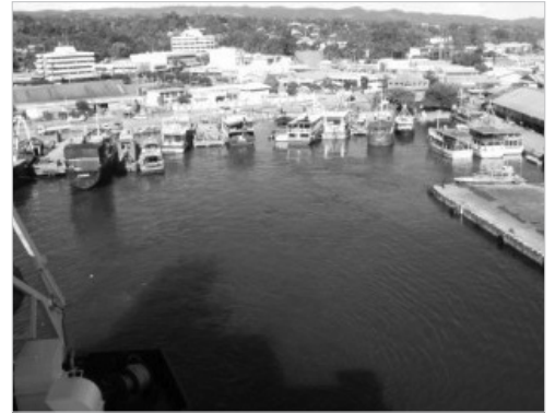
Honiara Port in Solomon Islands

Leaving your village to seek a better life has been part of SI culture for thousands of years. The nation is a group of islands and inter-island trading is common. New Zealand developed its RSE